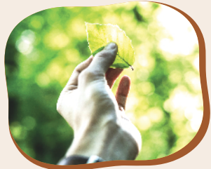
POLLUTION FREE ENVIRONMENT