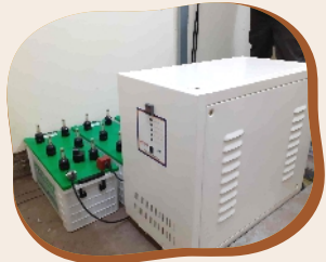
POWER BACK-UP FOR LIFTS & COMMON AREA