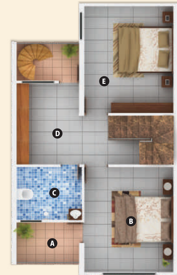
20'x40' Duplex Floor Plan